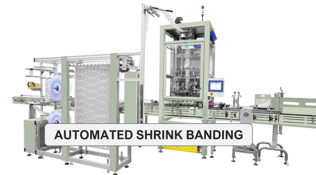
AUTOMATED SHRINK BANDING