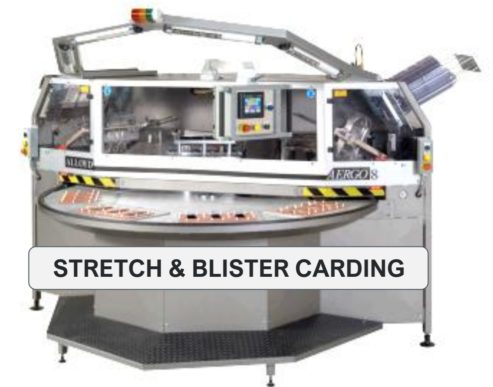
STRETCH & BLISTER CARDING